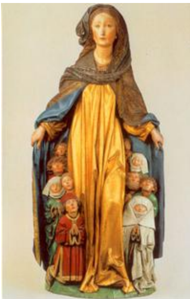
Virgin of Mercy in Ravensburg, Germany

The hero's journey as intercultural basic pattern of transformation or archetype of change may give some answers and methodic supports for that. In the Hero's journey training as developed by Paul Rebillot a crisis is enacted, which is experienced, presented and reflected by its participants using art, ritual and consciousness work thus strengthening confidence in the forces of self-regulation. In the article the five main elements of hero's journey structure are described followed by evidence and recommendations for its practical use in processes of transformation and healing.